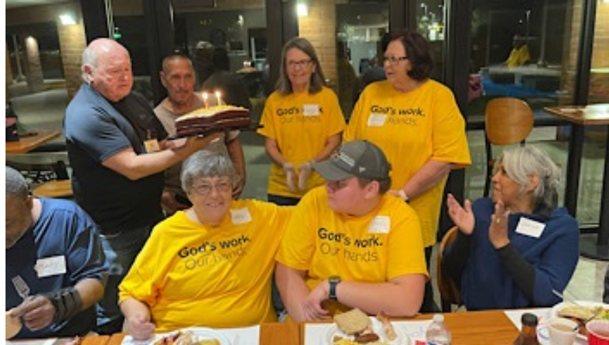
Celebrating Our November Birthday People